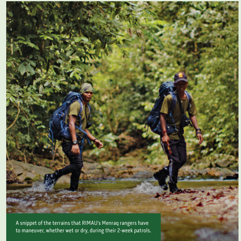
A snippet of the terrains that RIMAU's Menraq rangers have to maneuver, whether wet or dry, during their 2-week patrols.

The effective conservation of the Malaysian wild tiger requires a concerted, collaborative effort from all stakeholders. This section outlines the current efforts, future plans and funding spent or required by the government, relevant authorities and NGOs involved in tiger conservation.